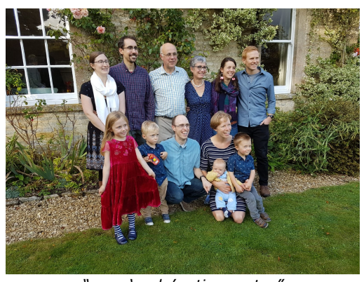
".. an 'early' retirement .."

expect to travel a little more, notably in June to the Passion Play at Oberammergau.